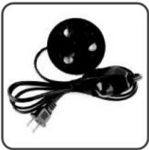
1 Power Code with Dimmer Control Switch