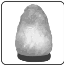
1 Salt Lamp